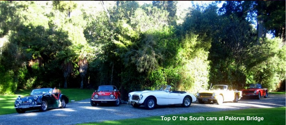
Top O' the South cars at Pelorus Bridge