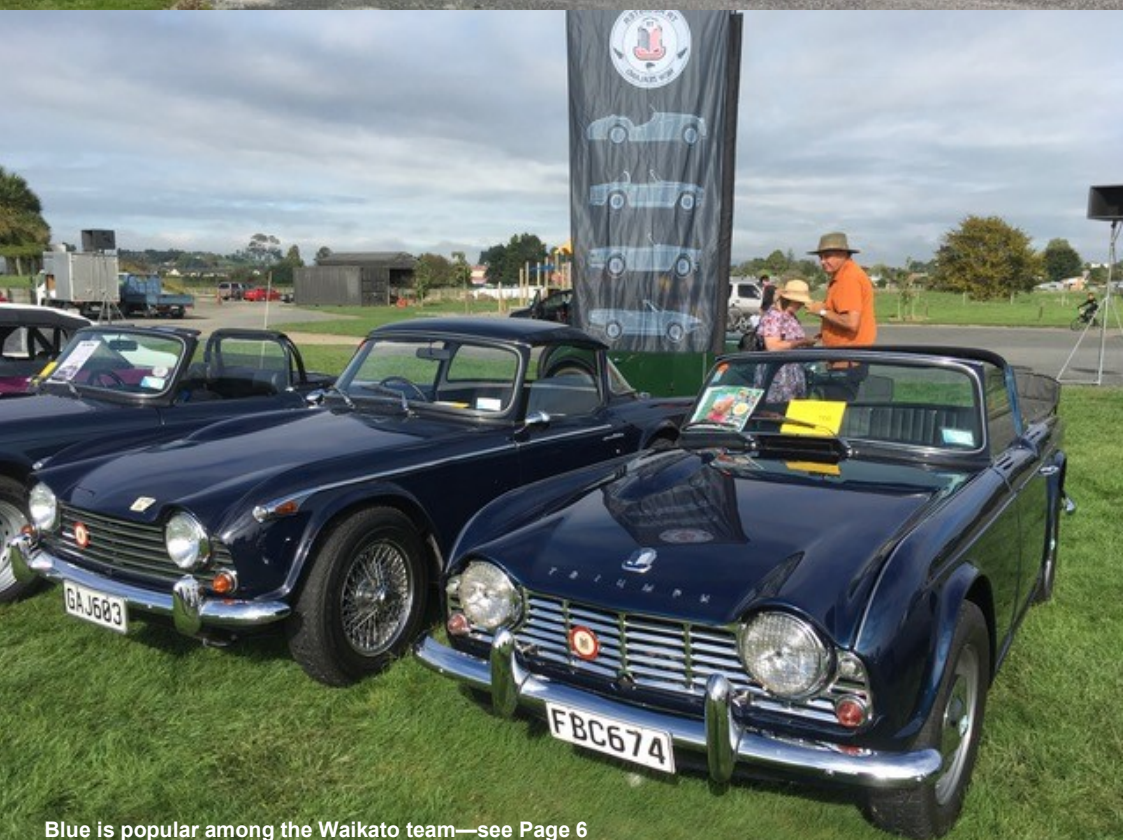
Blue is popular among the Waikato team—see Page 6