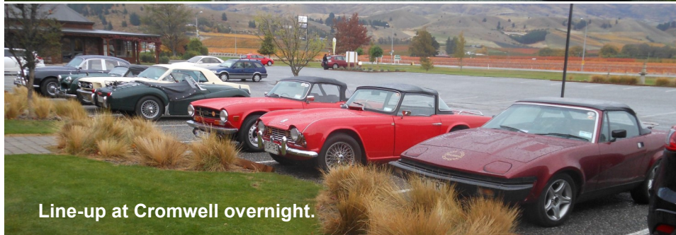
Line-up at Cromwell overnight.