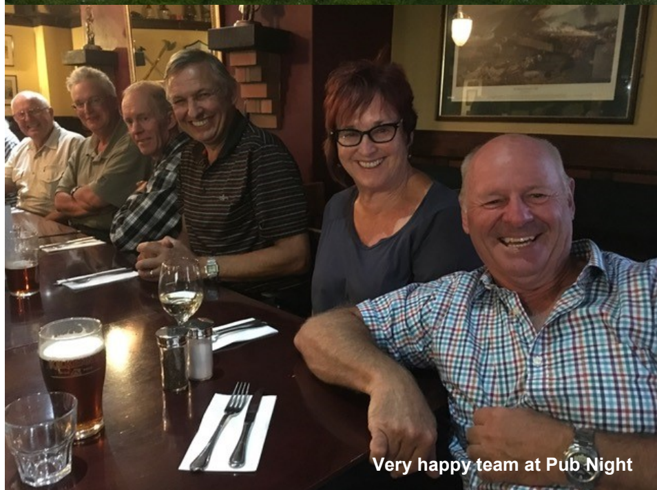
Very happy team at Pub Night