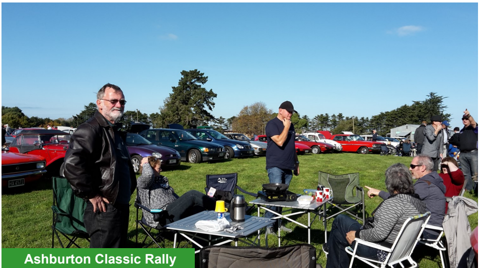
Ashburton Classic Rally