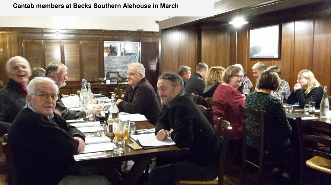
Cantab members at Becks Southern Alehouse in March