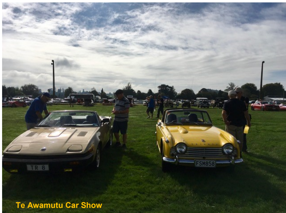
Te Awamutu Car Show