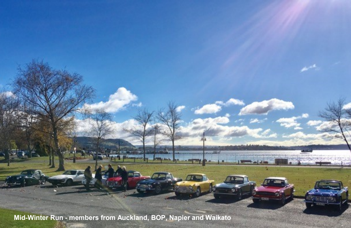
Mid-Winter Run - members from Auckland, BOP, Napier and Waikato