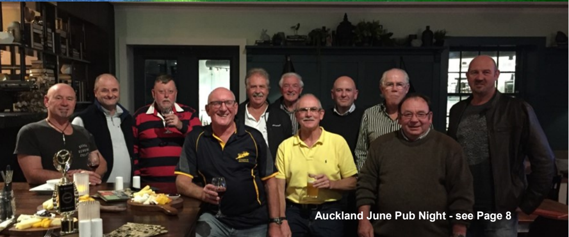
Auckland June Pub Night - see Page 8