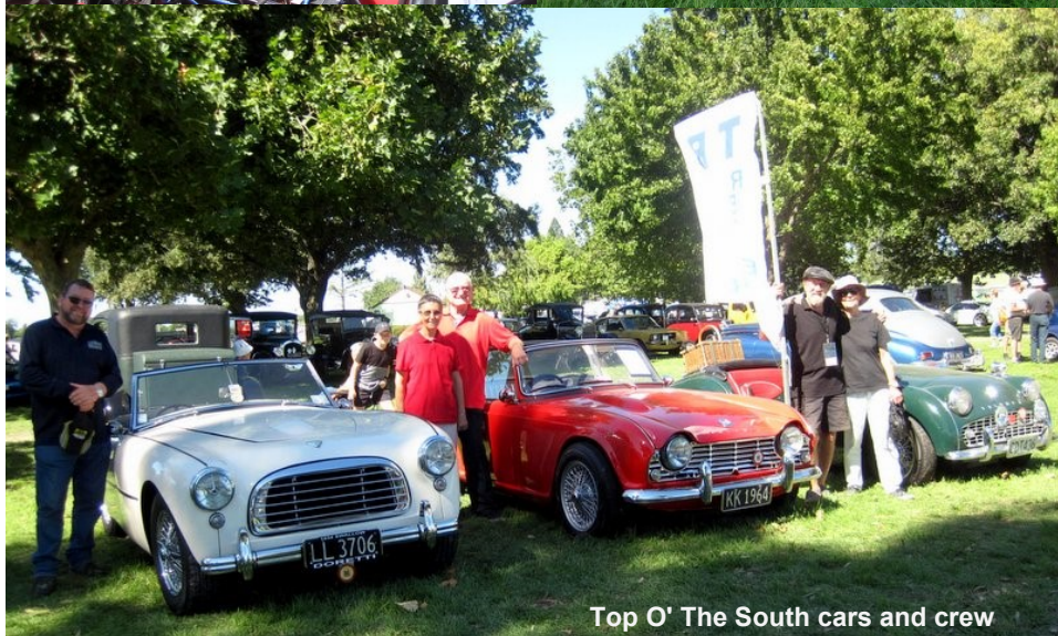
Top O' The South cars and crew