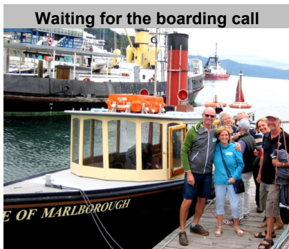
Waiting for the boarding call