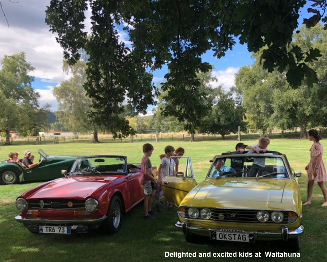
Delighted and excited kids at Waitahuna