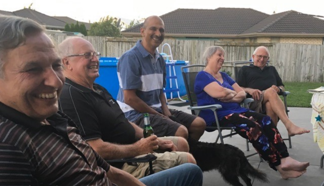
Waikato TR team relax