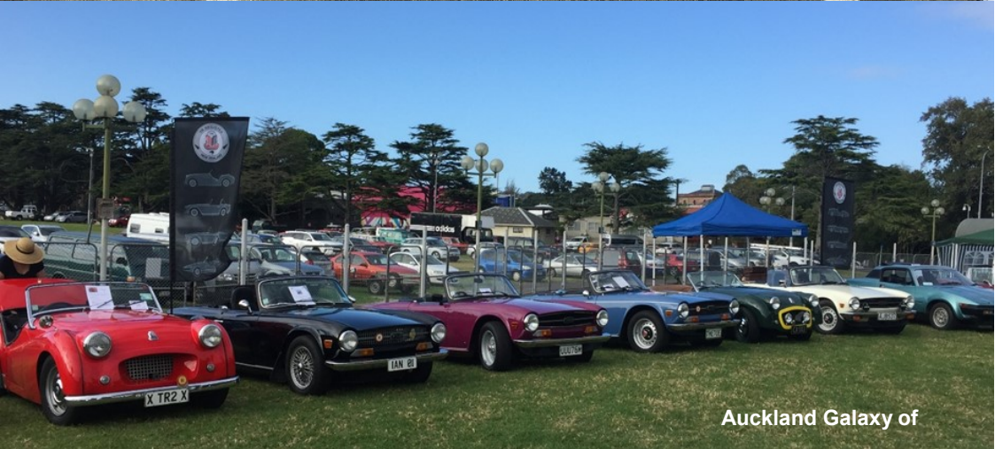
Auckland Galaxy of