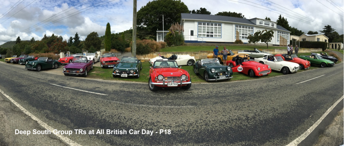
Deep South Group TRs at All British Car Day - P18