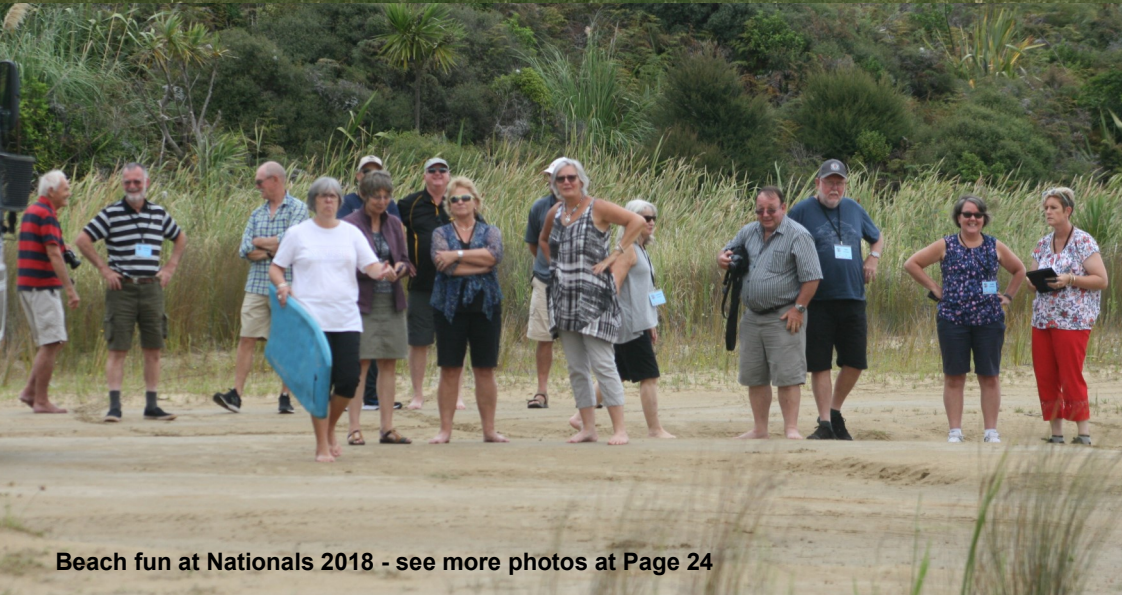
Beach fun at Nationals 2018 - see more photos at Page 24