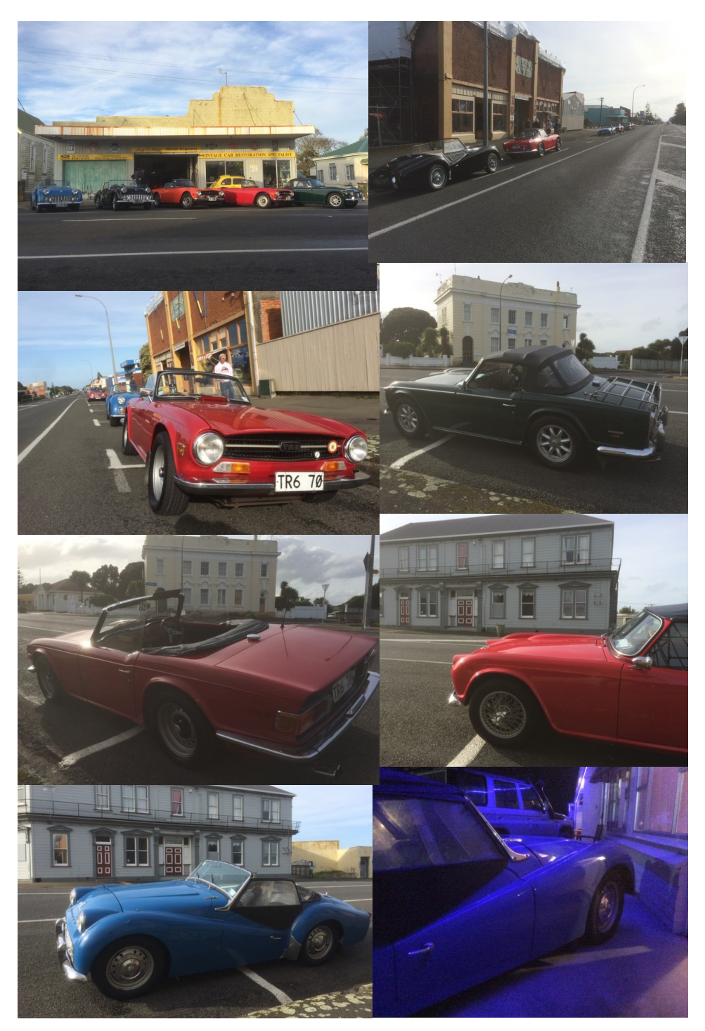
TRansmission — TR Register (NZ) Inc.