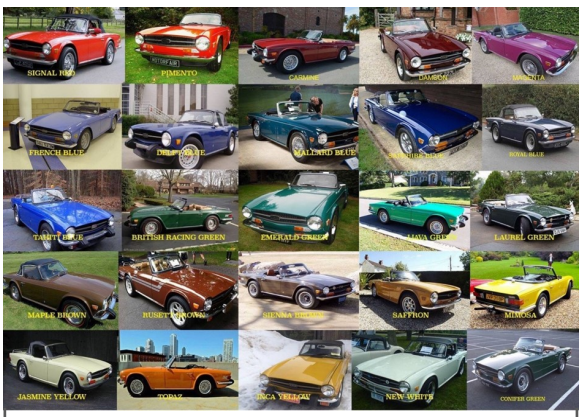
Cool selection - see back cover

Not all 69's to be fair but a great selection highlighting the many varied hues available to us!